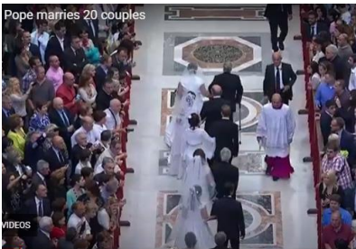
Pope marries 20 couples