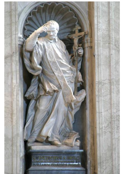
St. Vincent de Paul Founder Statue by Pietro Bracci, 1754, located in St Peter's Basilica

So, if you are ever being tried in our Faith, go to Jesus and His Divine Mercy, and immerse yourself in It, as well as ask St. Vincent, who dealt with this, for his intercession.